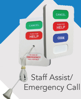
Staff Assist/ Emergency Call