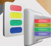
Electronic Flag/ Room Status