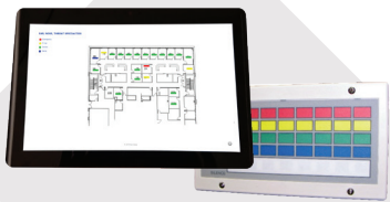
Nurse Call Annunciator